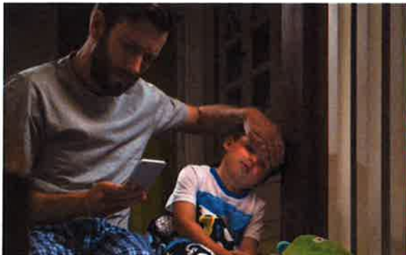
If your doctor is unavailable