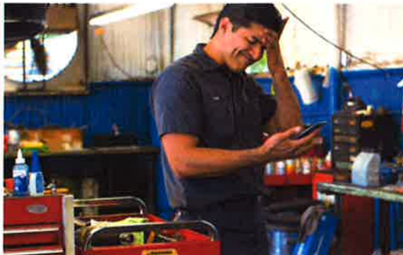
If there's no time for an office visit