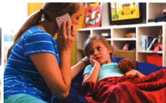
For pediatric care for any age