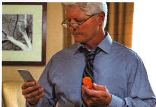
If you need a short-term prescription refill